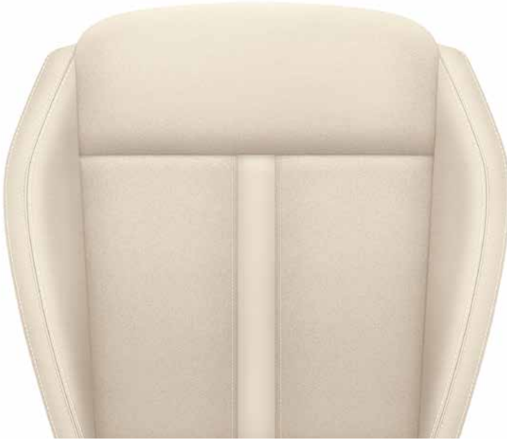
BEIGE SUEZIA LEATHER