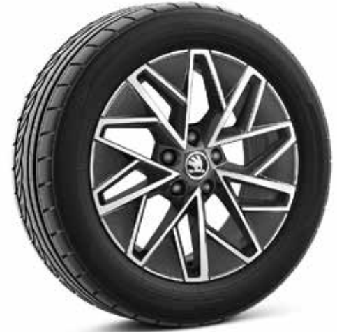
STYLE: ROTARE 43.18 CMS (R17) ALLOY WHEELS