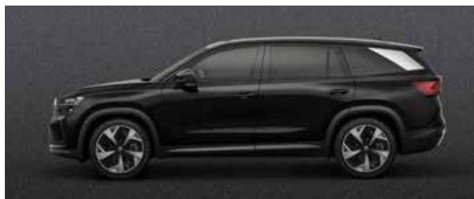
Magic Black metallic