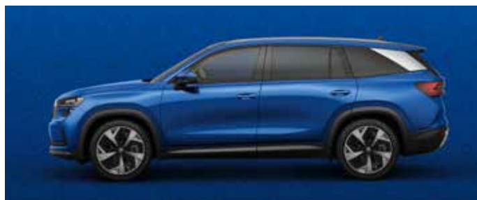
Race Blue metallic