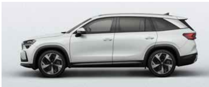
Moon White metallic