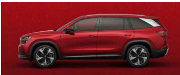
Velvet Red metallic