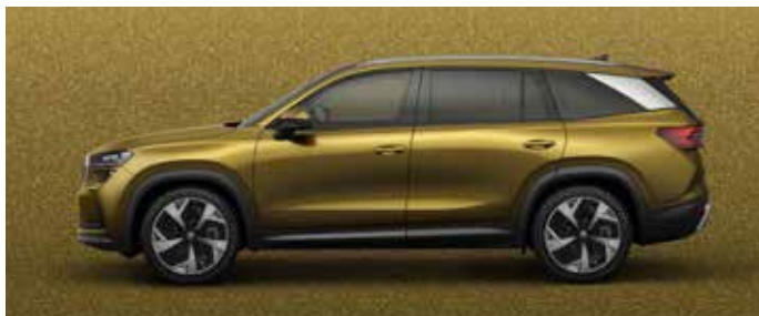
Bronx Gold metallic*