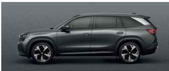
Graphite Grey metallic