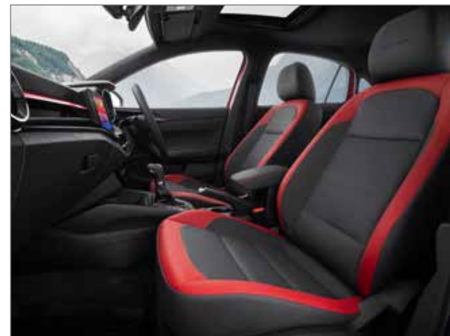
»» Monte Carlo Inscribed Ventilated Front Leatherette Seats