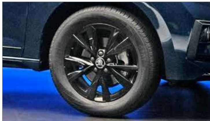
» R16 Black Alloy Wheels