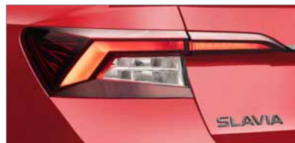
» Darkened Tail Lamps