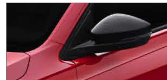
» Glossy Black ORVMs