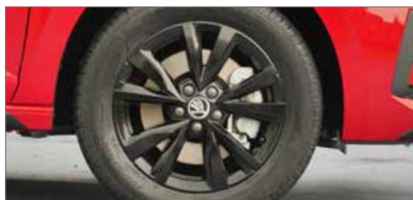
» R16 Black Alloy Wheels