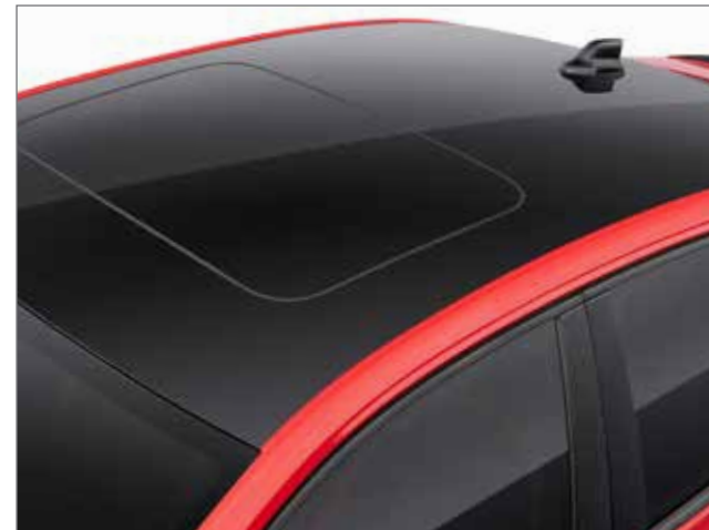
»» Dual Tone Electric Sunroof