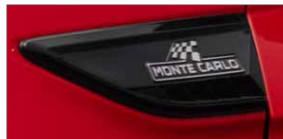
» Exclusive Monte Carlo Badging