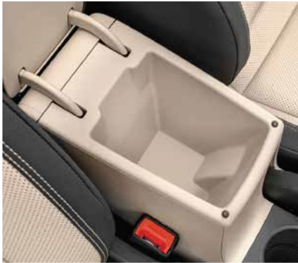
Storage In Front Centre Armrest