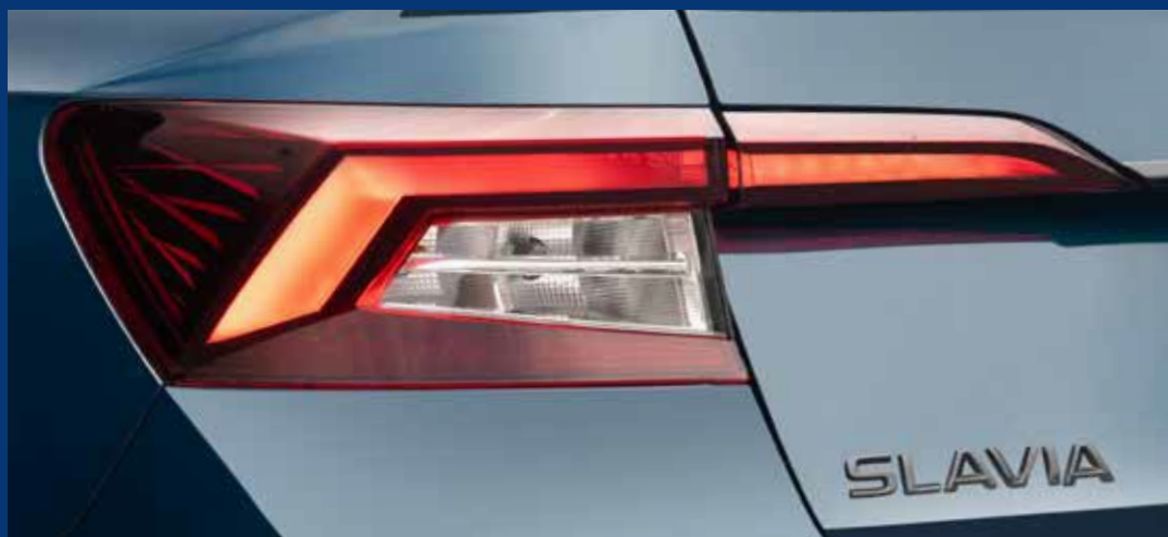
»» Darkened Tail Lamps