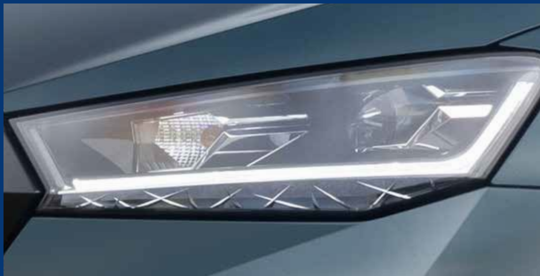
»» LED Headlamps with DRLs