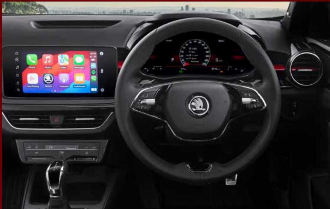
»» 20.32cm Škoda Virtual Cockpit with Red Theme