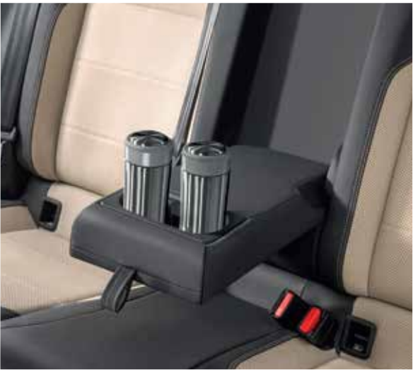
Cupholders In The Armrest