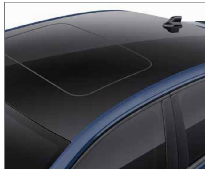
»» Dual Tone Roof with Electric Sunroof