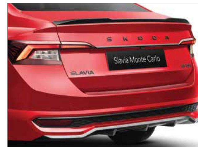
»» Sporty Black Exterior Package