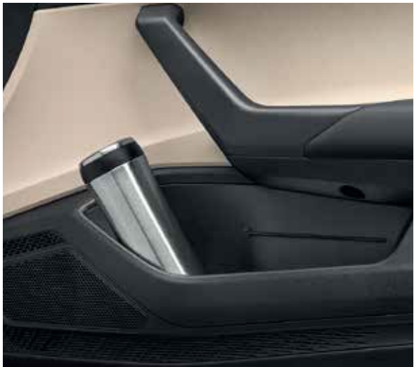
Storage In Front And Rear Doors