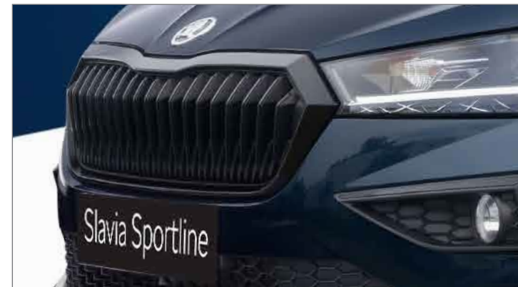
» Black Škoda Signature Grill