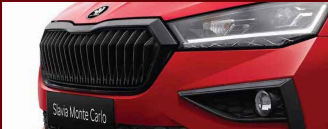
»» Black Škoda Signature Grill