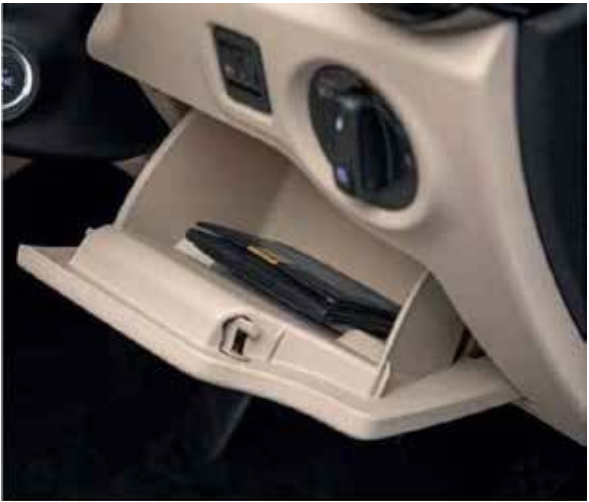
Driver Storage Compartment

Never compromise on boot space. Škoda Slavia sets the standard with best-in-segment storage – 521 liters with rear seats up, and a whopping 1050 liters when folded down.