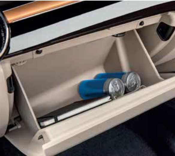
Cooled Glove Box