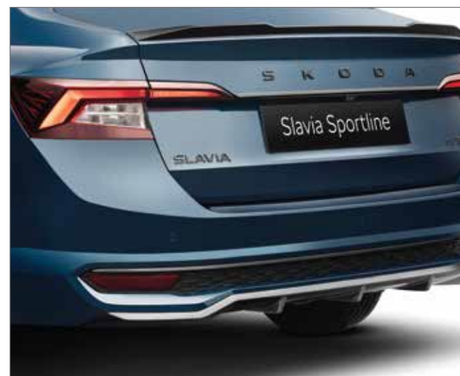
»» Sporty Black Exterior Package